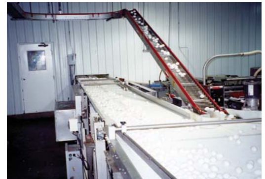
Lubing Soft-Ride™ Belt Conveyor, Curve Conveyor and Accumulator Table.

Technical details subject to change. 10 / 2014